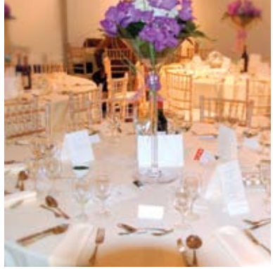
Floral Displays by PETAL PRIDE.

Free on-street parking is available around the Museum building.